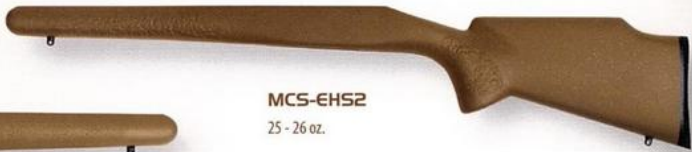
MCS-EHS2 25 - 26 oz.