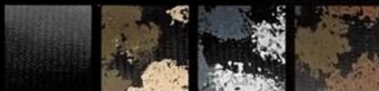
clear gap midnight black forest