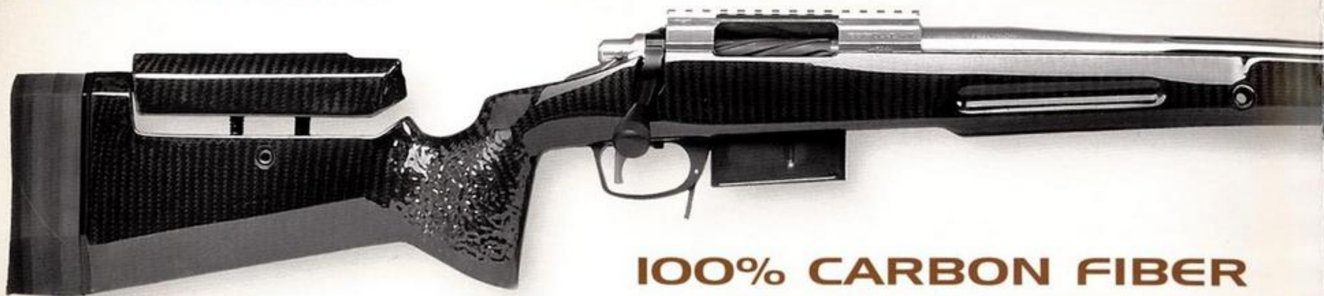
MCS-T2A ELITE TACTICAL CLEAR Shown with optional High Gloss finish.