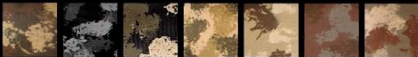
woodland midnight gap desert sage desert mud forest