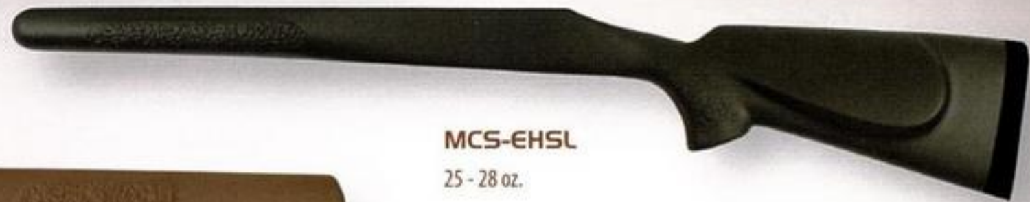
MCS-EHSL 25 - 28 oz.