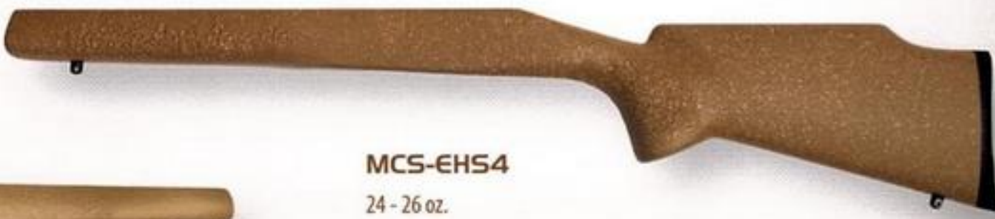
MCS-EHS4 24 - 26 oz.